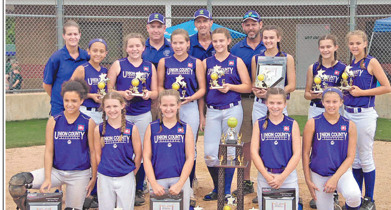
The Union County 12U Dizzy Dean Girls Softball Team